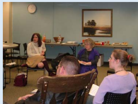
Shimer Assembly, trying to adapt to its new environment, met this week on Tuesday. This photo is from its last weekend meeting.